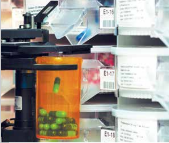
Robotic arm counts and fills without cross-contamination.