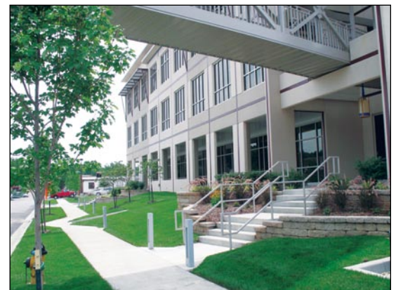
New Customer Service Building opened Spring 2008