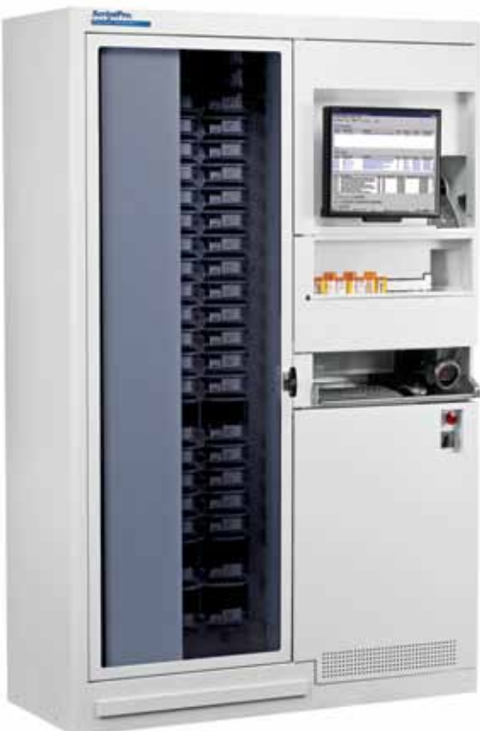
Compact Robotic System (CRS)

In short, every pharmacy SHOULD use robotics for safety and productivity. It's clearly the way pharmacies will operate in the future!