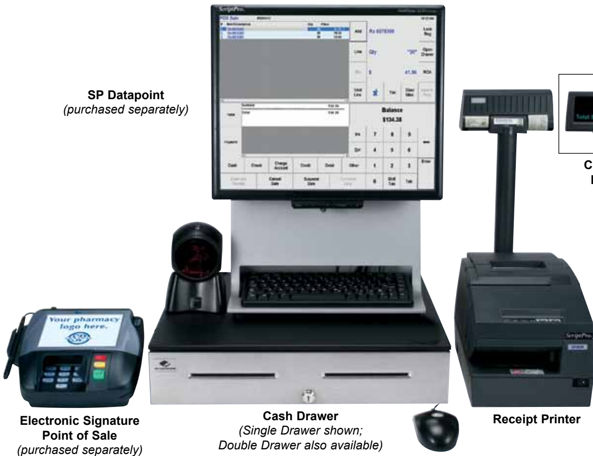
Electronic Signature Point of Sale (purchased separately)