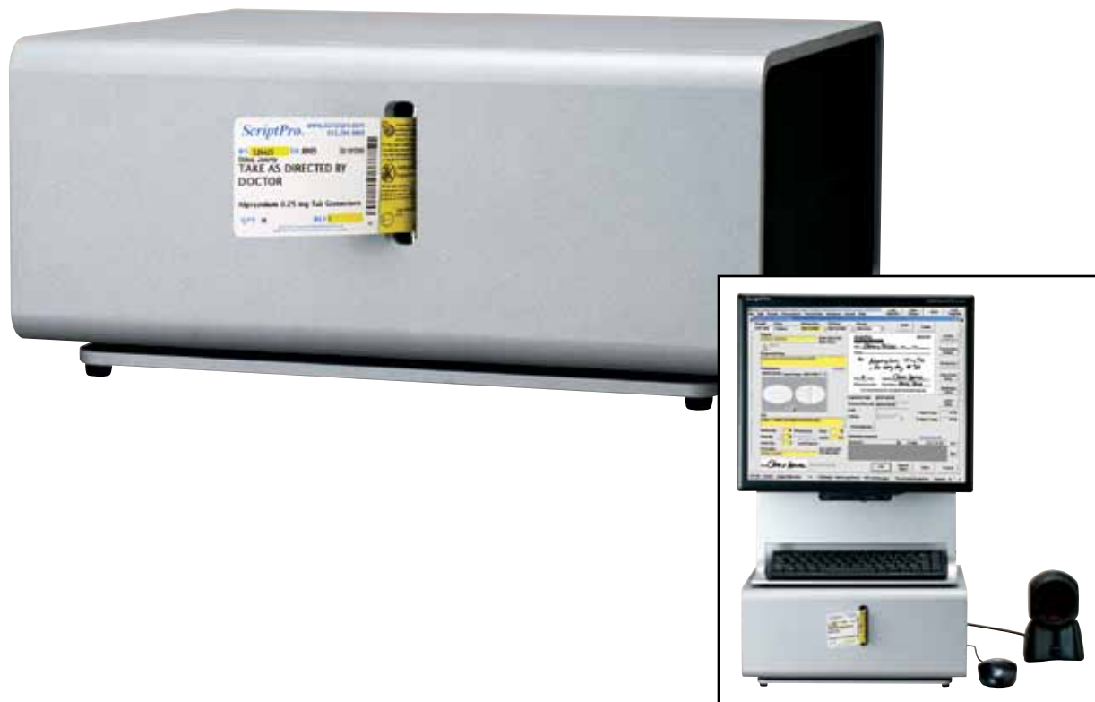
SP Printer with an SP Datapoint