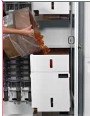
Pour vials directly into the dispenser