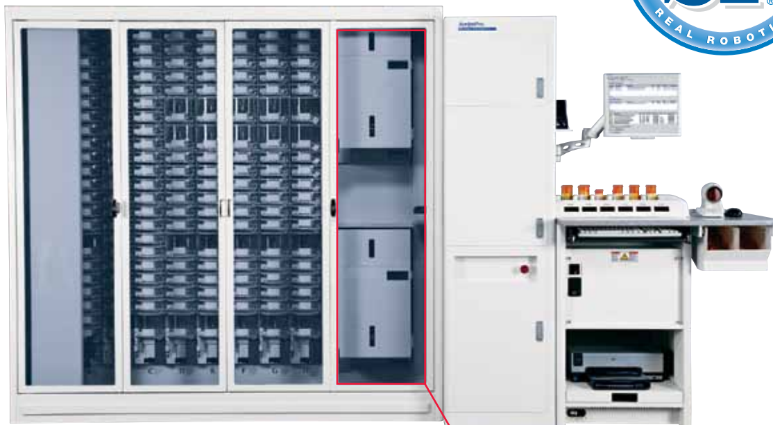
SP 200 Robotic Prescription Dispensing System with Collating Control Center and optional bulk loader