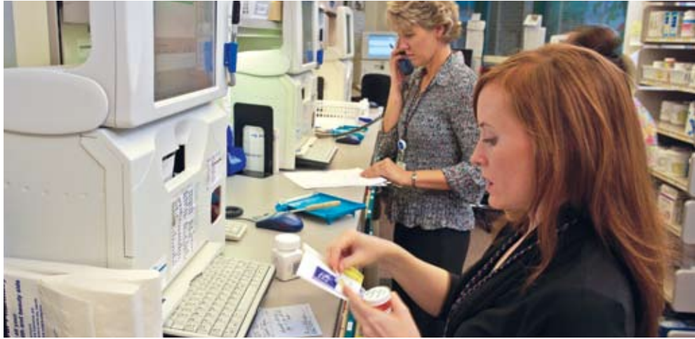
SP Central boosts pharmacy productivity

The Institute of Medicine's (IOM) Six Aims for healthcare organizations include providing care that is safe, effective, patient-centered, timely, efficient, and equitable. When Children's Mercy Hospitals and Clinics (CMH&C) in Kansas City, MO, teamed up with ScriptPro to address some of the growing demands of its Outpatient Pharmacy, these Six Aims were the guiding principles.