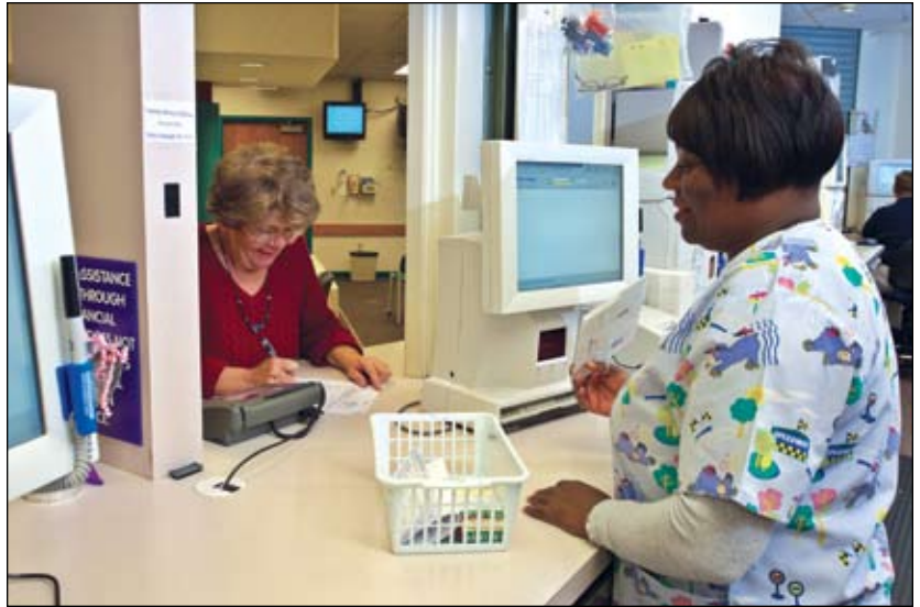
Dispense process includes prompts for patient counseling and signature capture