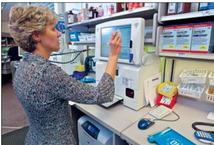
Touchscreen and barcode controls provide added efficiencies