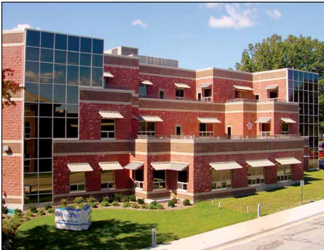
ScriptPro headquarters in Mission, Kansas.