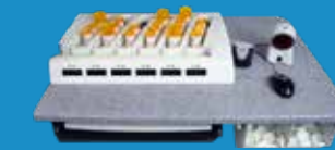
6-Slot Collating Control Center