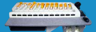
12-Slot Collating Control Center