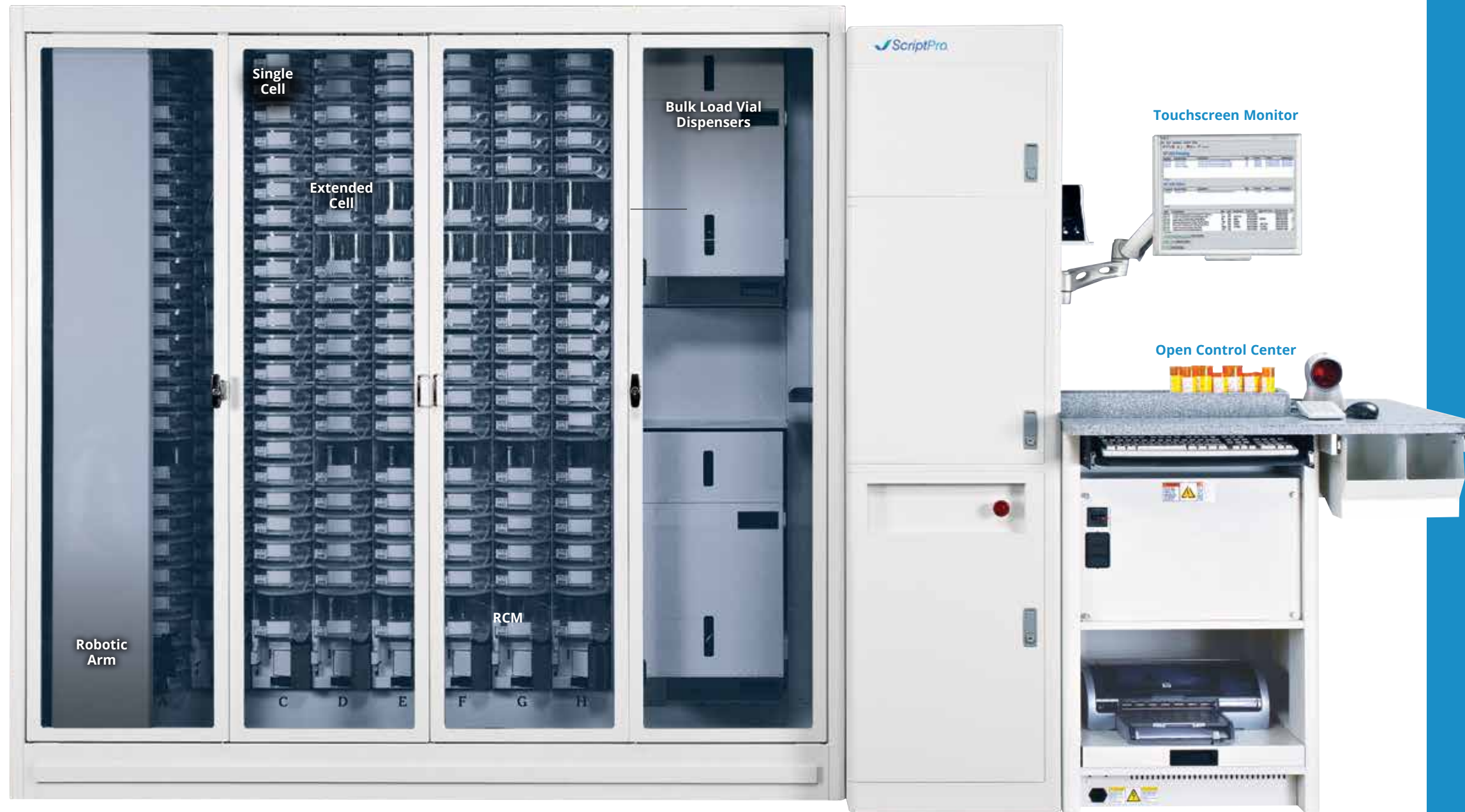
SP 200 Robotic Prescription Dispensing System